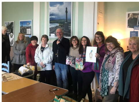
An art class at Glenmona House, Cushendun

“I am very passionate about the area I live in and this is an exciting opportunity to work alongside the community and to empower and support them around issues which they feel are important.”