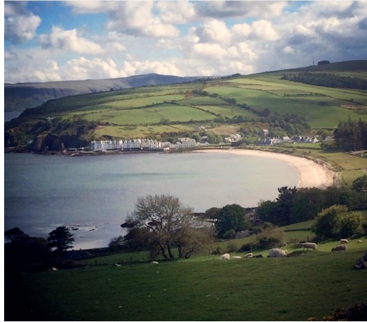
Beautiful Cushendun, County Antrim

are well placed to lead on this work and to provide an open and transparent process for everyone involved.