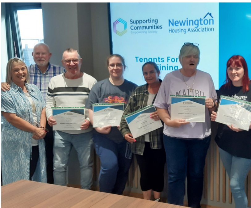
Newington Tenants Forum members receive their training certificates from Supporting Communities.

Supporting Communities helped the new forum to get started through a programme of training sessions aimed at giving them the skills and confidence to play an active role in influencing service delivery at Newington. The group covered topics such as Tenants Forum training, Team Building, Getting your Message Across, Effective Meetings, and Volunteering.