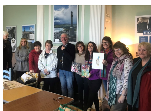
An art class at Glenmona House, Cushendun

locally-driven social enterprise projects.