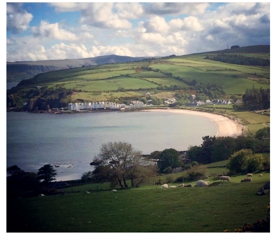
Beautiful Cushendun, County Antrim

includes many local amenities, shops and residential accommodation within the village. It is fair to say that over the years, the Trust's relationship with the local community in Cushendun has been somewhat turbulent with relations coming under strain at times. The National Trust realised that they needed a respected independent intermediary to help them re-engage positively with local stakeholders and the community in general.