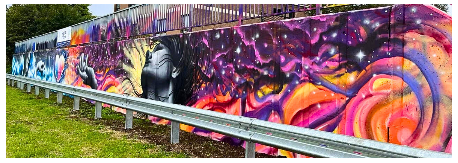
Beacon of Hope Mural in Ballykeel