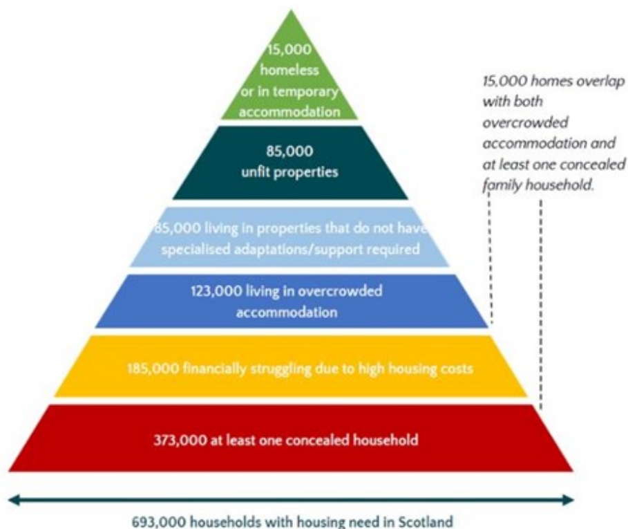
Figure 1: Summary of estimates of existing housing need in Scotland